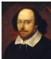
A Midsummer Night's Dream