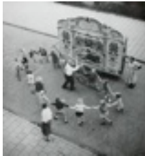
Voices of Children