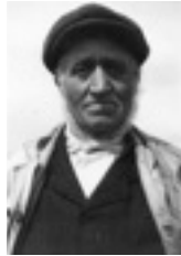
The Seeds of Love - collecting English folk music