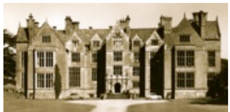
The House - a thousand years

CONTACT info@opus-a.co.uk 01386 840016/07812 242437 36 Berrington Road, Chipping Campden, GL55 6JA