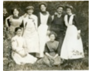
Green and Pleasant Land